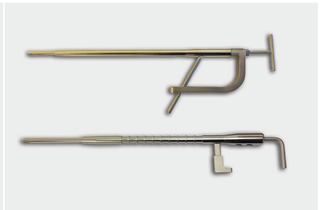
Telescopic pediatric nails for the treatment of Shepherd's Crook deformity