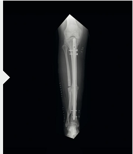
Postoperative x-ray of a corrective osteotomy stabilized with the custom tibia nail