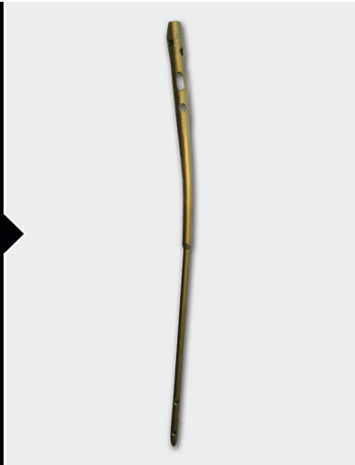
Custom-made tibia nail with specific design geometries