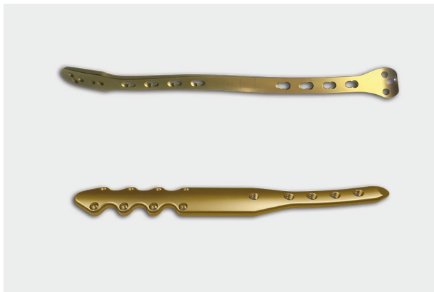
Femoral and tibial plates for the treatment of bone tumors and non-unions

41medical does develop specific solutions dedicated to Trauma, CMF, Spine and Sports Medicine.