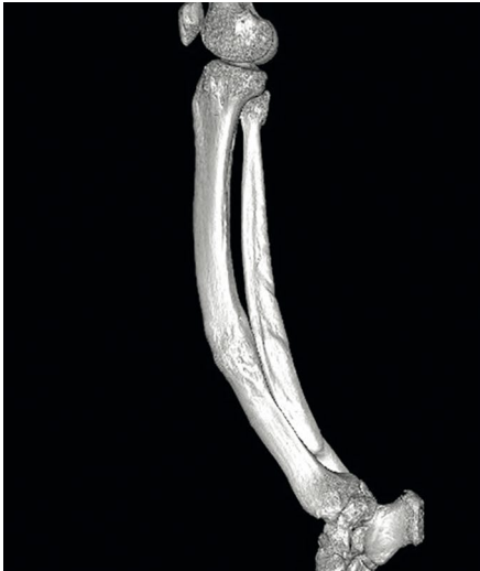
Preoperative CT-scan of a deformed tibia due to OI

Osteogenesis Imperfecta (OI) treatment with a custom made tibia nail.